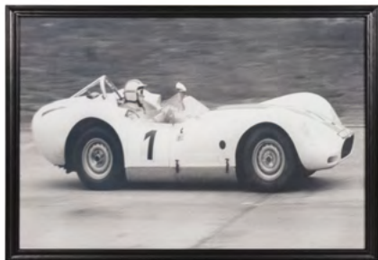
Race Car White

Also available, the image of car no. 1 is a 1958 Lister Jaguar prototype fitted with a 3.0 litre front mounted Jaguar engine. A similar car, driven by Briggs Cunningham, went for auction in August 2013 for USD 1,980,000.00. Briggs Cunningham was a pioneering American racer, his cars were the first to be painted with racing stripes.