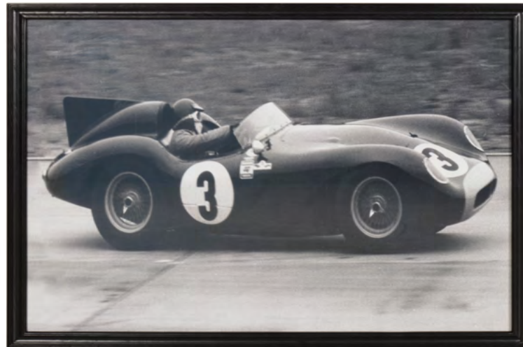
Race Car Black