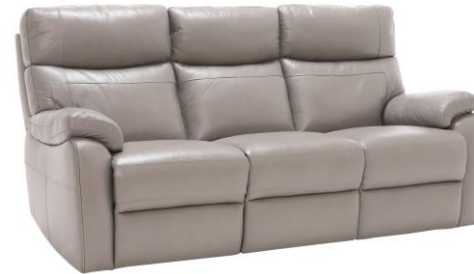
3 Seater Sofa H98 x W202 x D95cm