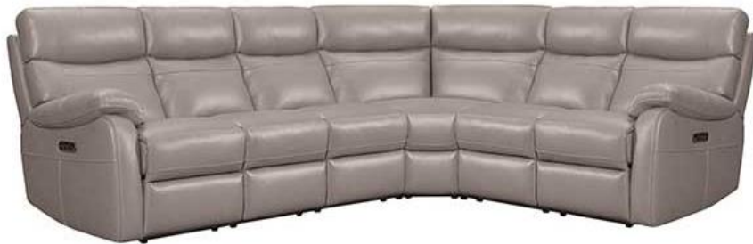
Large Right Hand Facing Corner Group H98 x W388 x D232cm