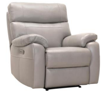
Chair H98 x W92 x D95cm