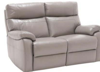
2 Seater Sofa H98 x W146 x D95cm