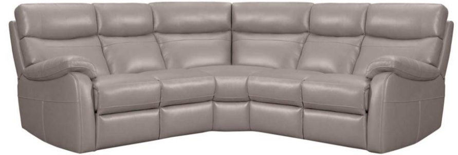
Corner Group H98 x W232 x D232cm

This range is available in many different hides, each with unique characteristics including scars, grain variation and other markings. It is normal for leather to show signs of creasing and stretching and for interiors to lose density from use.