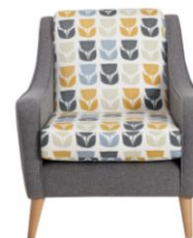
Designer Chair H85 x W71 x D80cm