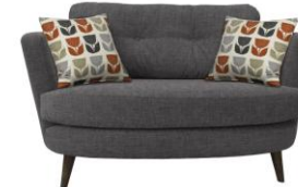
Oval Cuddler H84 x W135 x D94cm