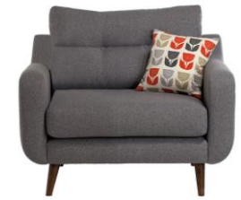
Standard Chair (Also available in leather) H86 x W89 x D92cm