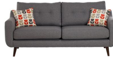
Large Sofa (Also available in leather) H86 x W189 x D92cm