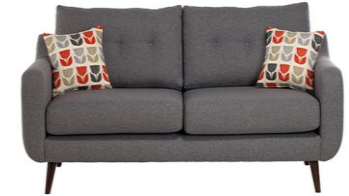
Small Sofa (Also available in leather) H86 x W154 x D92cm