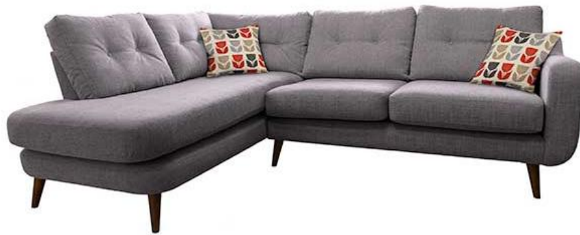
LHF Corner Group (also available as RHF) H86 x W242 x D183 cm