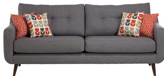
Extra Large Sofa (Also available in leather) H86 x W224 x D92cm