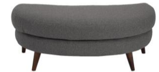
Oval Cuddler Stool H42 x W115 x D65cm