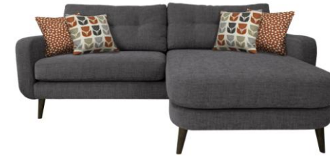
Lounge Sofa H86 x W224 x D153cm

Regularly plump all cushions to maintain performance. Please refer to the care and commitment leaflet for further details.