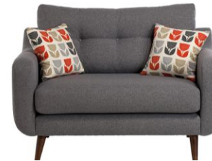
Snuggler (Also available in leather) H86 x W124 x D92cm