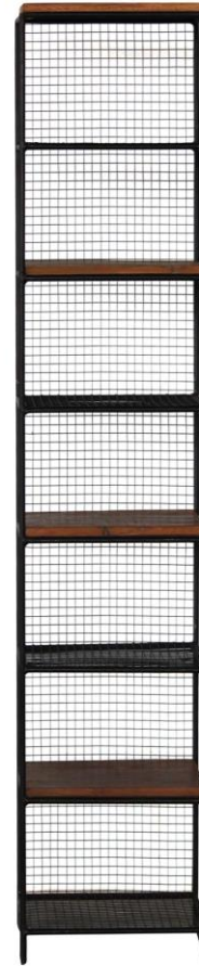
Layla Cube 7 Shelf Storage Unit (CFC-169) H185 x W38 x D38cm