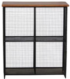
Layla Cube 4 Shelf Storage Unit (CFC-170) H85 x W76 x D38cm

Tall cabinets may need fixing to the wall to prevent tipping, most items being marked accordingly.