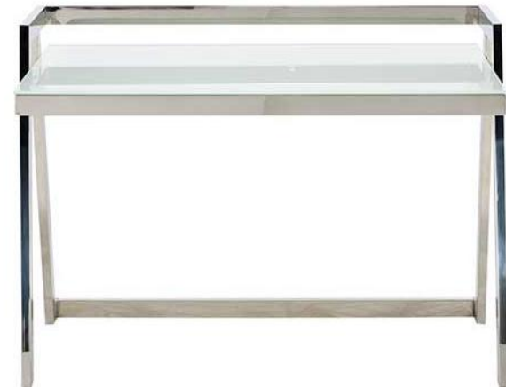
Luka Desk H86 x W120 x D65cm