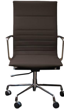
Lynley High Back Office Chair H115 x W62 x D62cm