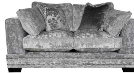
2 Seater Sofa Available as pillow back H89 x W185 x D101cm