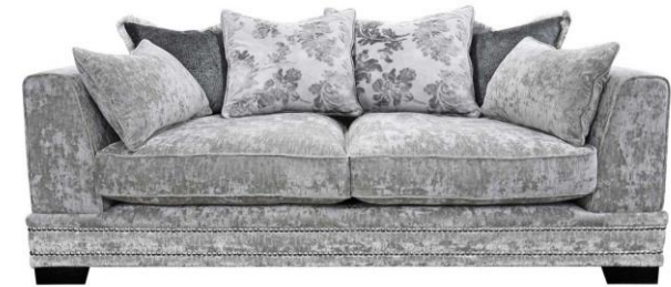
3 Seater Pillow Back Sofa Available as standard back H89 x W206 x D101cm

Regularly plump all cushions to maintain performance. Please refer to the care and commitment leaflet for further details.