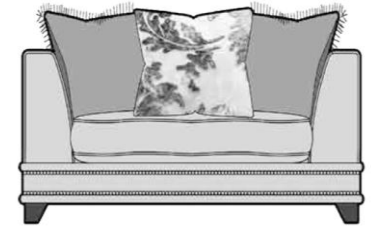
Pillow Back Snuggler Available as standard back H89 x W153 x D101cm