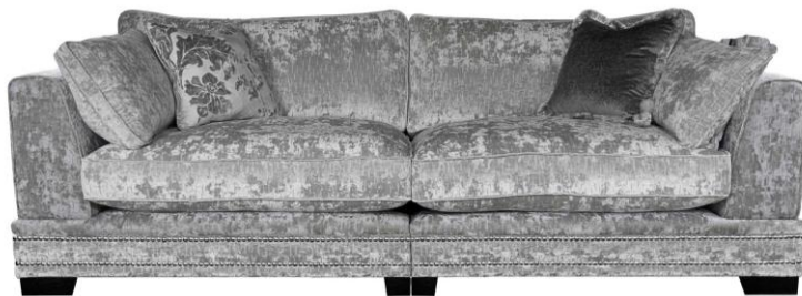
4 Seater Split Frame Sofa Available as pillow back H89 x W257 x D101cm