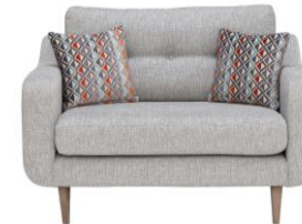
Snuggle Chair W124 x D92 x H86cm