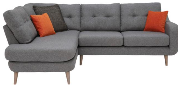
Left Hand Facing Corner Group W242 x D183cm x H86 Also available as Right Hand Facing