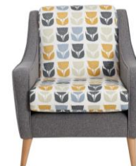
Designer Chair W71 x D80 x H85cm