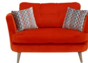
Oval Cuddler W135 x D94 x H84cm