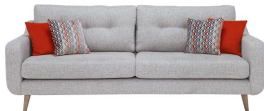
Extra Large Sofa W224 x D92cm x H86