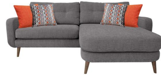
Lounge Sofa W224 x D153 x H86cm

Regularly plump all cushions to maintain performance. Please refer to the care and commitment leaflet for further details.