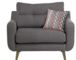
Standard Chair W89 x D92 x H86cm