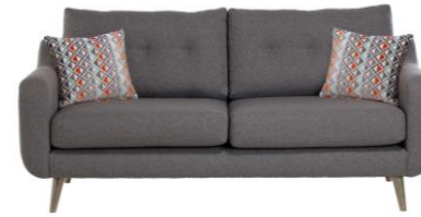
Large Sofa W189 x D92 x H86cm