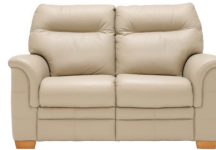
2 Seater Sofa H100 x W155 x D100cm