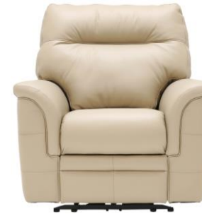
Recliner Armchair AVAILABLE AS MANUAL OR POWER RECLINER H100 x W97 x D100cm