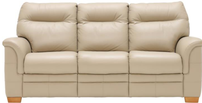
3 Seater Sofa H100 x W208 x D100cm

Regularly plump all cushions to maintain performance. Please refer to the care and commitment leaflet for further details.