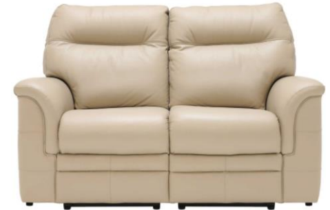
Recliner 2 Seater Sofa AVAILABLE AS MANUAL OR POWER RECLINER H100 x W155 x D100cm