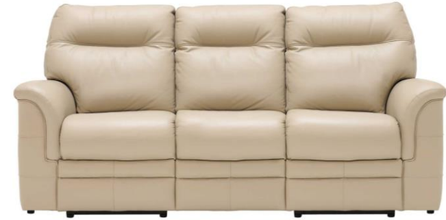
Recliner 3 Seater Sofa AVAILABLE AS MANUAL OR POWER RECLINER H100 x W208 x D100cm