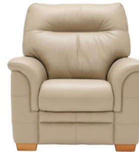
Armchair H100 x W97 x D100cm